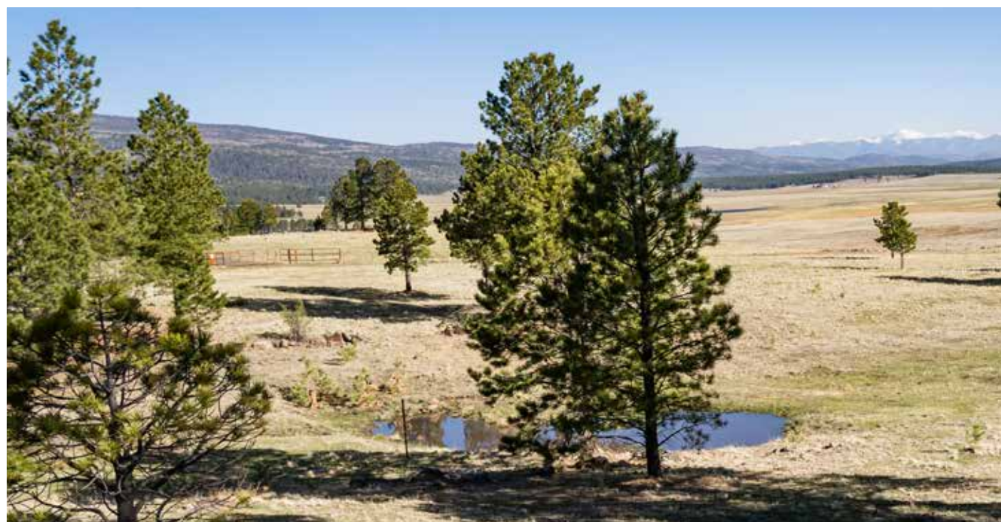
LONESOME DOVE VIEW | ST. JAMES SPORTING PROPERTIES