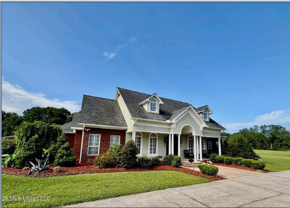
26 MLS United LLC

Welcome to your retreat in the heart of Lawrence County! Nestled on approximately 2 beautifully landscaped acres in Monticello, MS, this spacious 3,200+ sq. ft. home offers the perfect blend of comfort, functionality, and outdoor entertaining. Built in 2000, this well-maintained property features 6 bedrooms with 4 located upstairs and 2 downstairs, along with 3 full bathrooms designed to accommodate a growing family or guests with ease. Inside, you'll find an inviting floor plan with multiple living and working spaces, including two dedicated offices ideal for remote work, hobbies, or study areas. A formal dining room provides the perfect setting for family gatherings and special occasions. The bright sunroom overlooking the backyard creates a peaceful place to relax while enjoying views of the pool and outdoor entertaining area. Step outside to your own backyard oasis featuring an above-ground pool, expansive patio area, and a charming gazebo complete with a ceiling fan—perfect for entertaining year-round. The beautifully landscaped grounds, concrete circle driveway, and whole-house Generac generator add both curb appeal and peace of mind. This exceptional property combines space, privacy, and convenience in a desirable Lawrence County location. Don't miss the opportunity to make this stunning home your own!