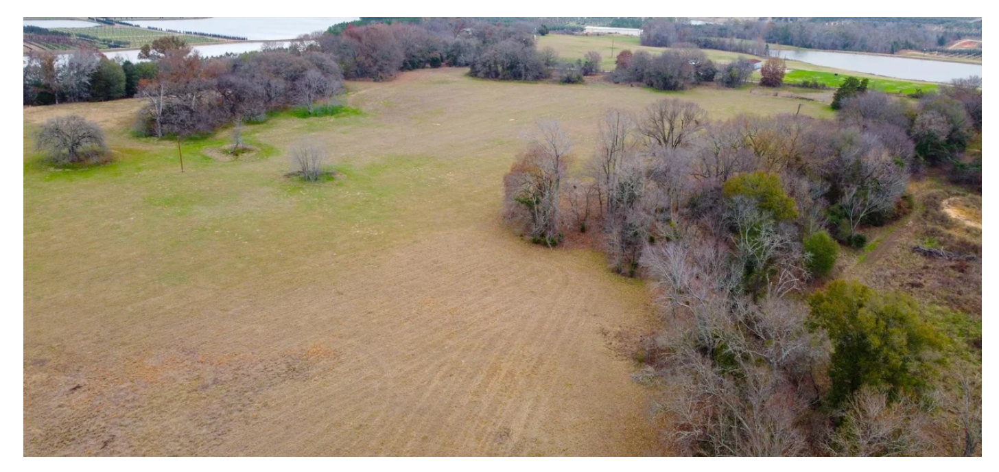
$574,000 28± Acres Van Zandt County