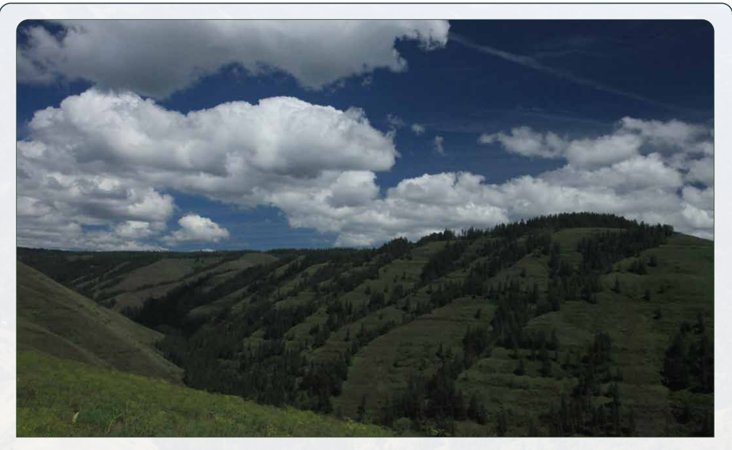
· Introduction ·

The Umatilla River Mountain Property is a beautiful testament to the unique lands of Eastern Oregon. Tucked away in a gorgeous valley, sits 1,906+/- deeded acres. Exceptional valley views full of wildlife, native grasses and flush timber pockets make up the majority of the property. To add to the beauty, the Umatilla River full of Rainbow Trout and other fly-hungry fish, runs right through the center of the property. Bordering the Umatilla National Forest and surrounding the historical Bar M Ranch, this property is a testament to the many generations who have enjoyed the recreational activities of the area.