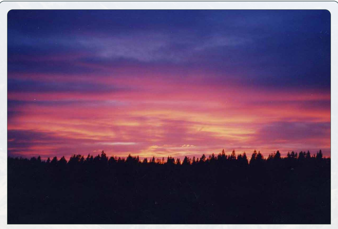
This property is available for showing to qualified buyers by appointment only. Inspection of this property must be arranged through the broker.