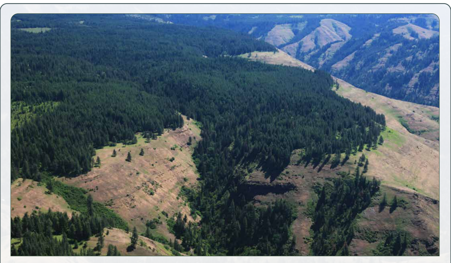
· LOCATION ·

The Umatilla River Mountain Property is located approximately 29± miles east of Pendleton, Oregon.