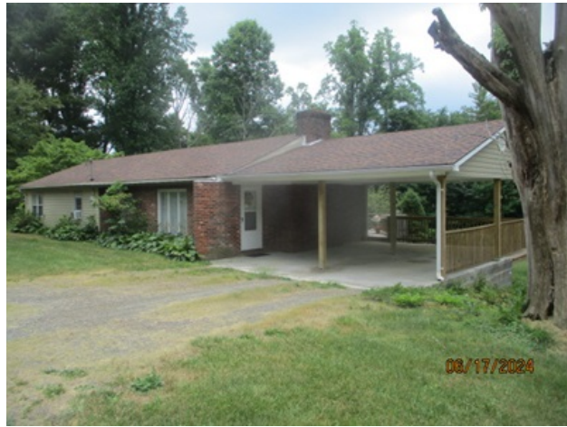
Main Structure Photo