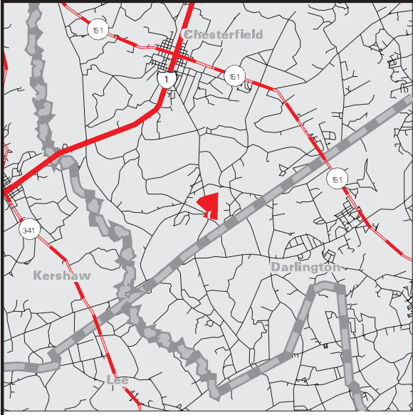
LOCATION MAP scale 1 inch = 4 miles