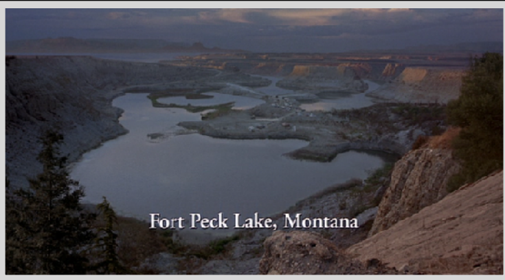
Fort Peck Lake, Montana