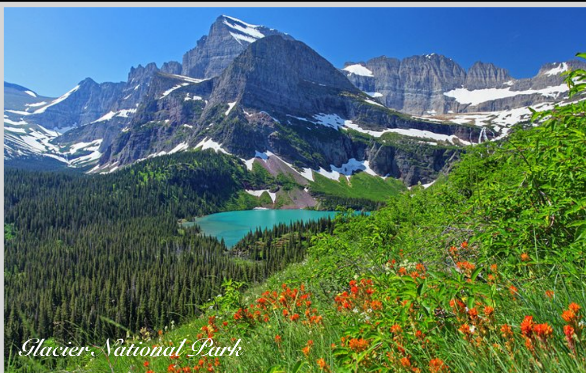
Glacier National Park

for a walk back in time or backpack, cycle, hike, or camp. While taking in the astounding sights of the glacier-carved peaks and valleys, set your binoculars on a diverse range of wildlife of bighorn sheep, mountain goats, deer, elk, ptarmigan, and both black and grizzly bear. This highway to heaven is a tough one to ever forget.