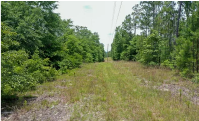
40 acres autauga county Alabama, AC +/-