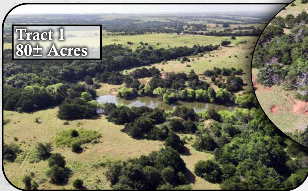
Tract 1 80± Acres

Native & Improved Grasses • Livestock Producer • Timber Excellent Hunting • 1± Acre Spring Fed Pond