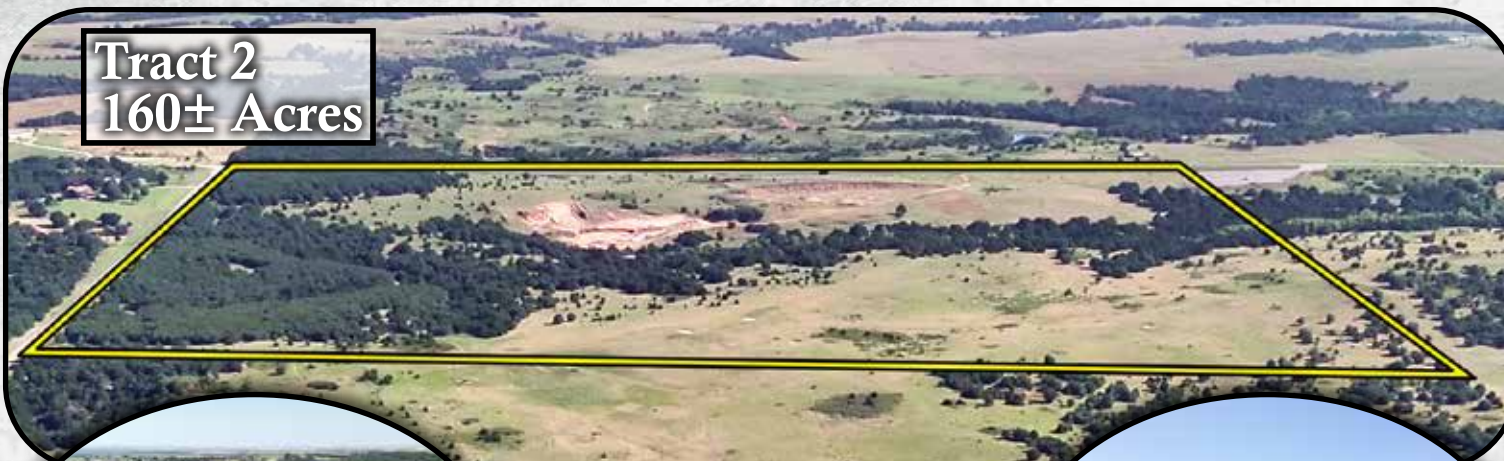
Tract 2 160± Acres

Legal Description West Half (W/2), of the Northeast Quarter (NE/4) of Section Fourteen (Sec. 14), Township Thirteen North (T13N), Range Twelve West (R12W), Indian Meridian, Blaine County, Oklahoma. Surface rights only