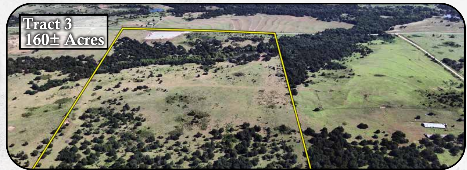
Tract 3 160± Acres

Legal Description Southwest Quarter (SW/4), Section Fourteen (Sec. 14), Township Thirteen North (T13N), Range Twelve West (R12W), Indian Meridian, Blaine County, Oklahoma. Surface rights only