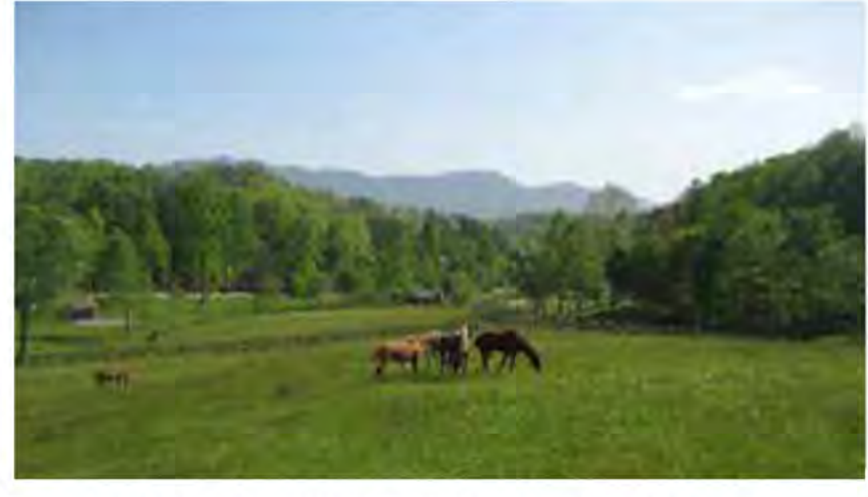
BEAUTIFUL HORSE FACILITY WITH EXCELLENT PASTURE

The Settlement at Thomas Divide P. O. Box 965 Bryson City, NC 28713 (828) 788-3648 www.ThomasDivide.com