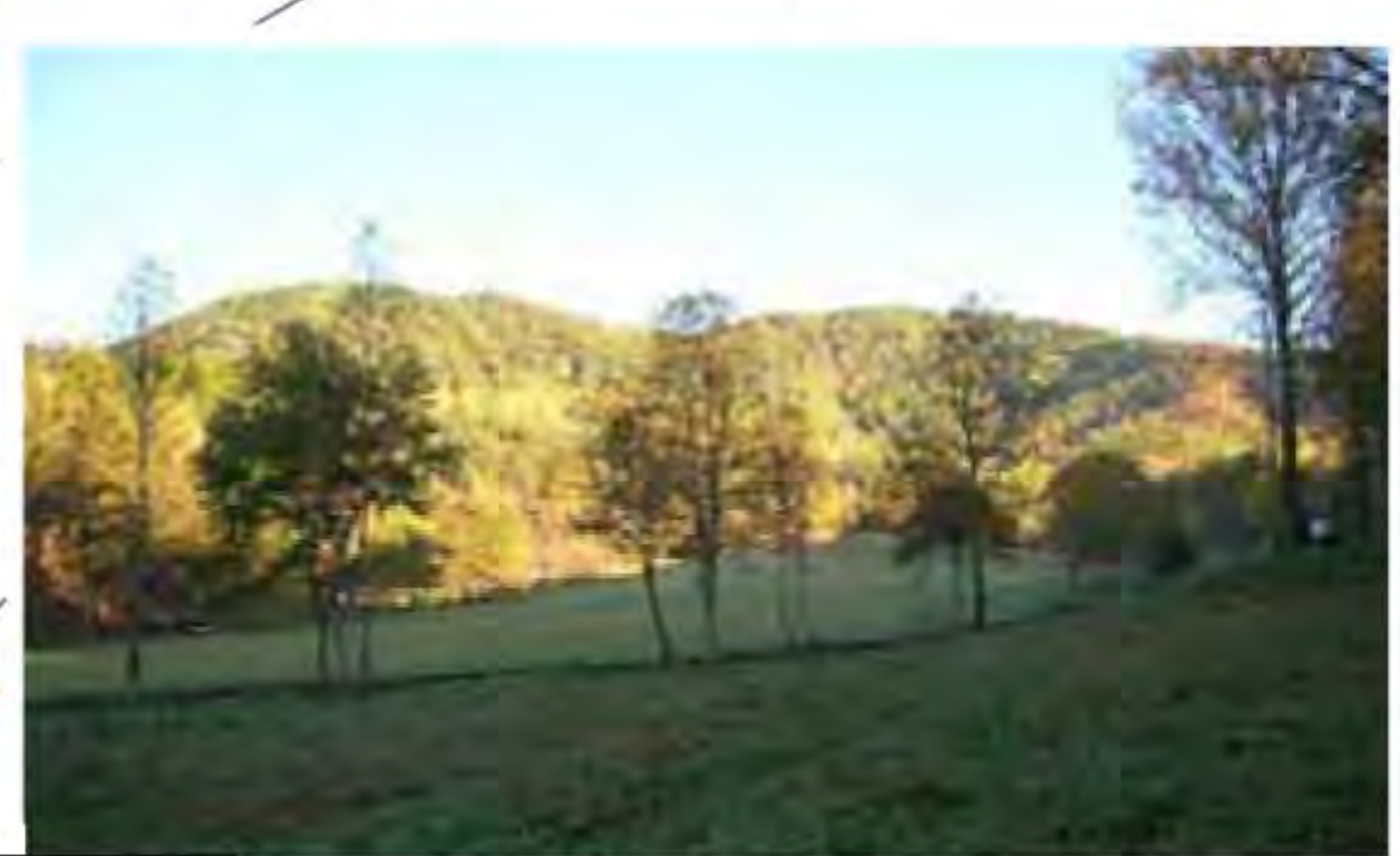
VIEW NW TO GREAT SMOKY MTNS. NATIONAL PARK